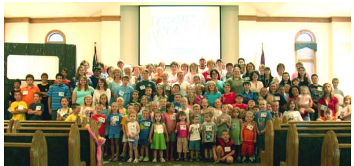
Students, teachers, and helpers crowd the stage for a group photo at VBS.

The average attendance was 129 including adults—the largest attendance we've ever had! We just praise God for the work He is doing at Cito and our community.